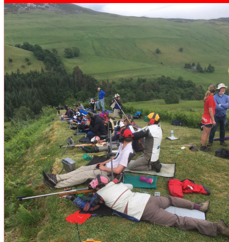
The Lions in the Lawrence Match