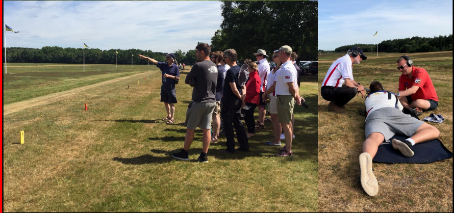
The Lions squad in action at previous training weekends