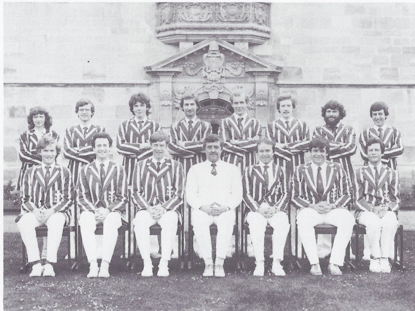
Oxford Blues Rifle Team 1981