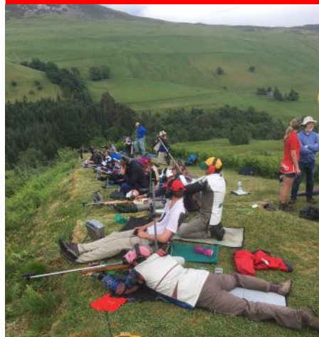
The Lions in the 2018 Lawrence Match